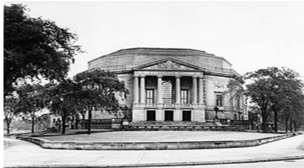
Severance Hall, Cleveland, Ohio